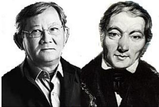
Two Philanthropists Who does or did the greater good?

PS is by no means the first 'visionary' to 'take' children from their parents. Robert Owen (1771-1858), who owned a mill town, New Lanark (now a UNESCO World Heritage Site), was a philanthropist and social reformer and early co-operative pioneer. At that time, other factory owners paid their workers in part or totally with tokens, which were only redeemable in the company store, which often supplied shoddy goods at extortionate prices. Owen's, however, were discounted retail shops whose profits were passed on to his employees.