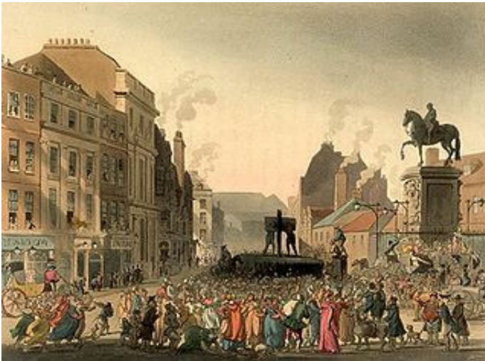
The pillory at Charing Cross in London, c.1808

However, I can't, but I can pillory them, now used as a verb but with the same intent as the original physical punishment a public humiliation.