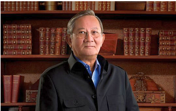
Are those books real?

http://jakartass.net/2013/07/putera-sampoerna-saint-or-sinner-4/