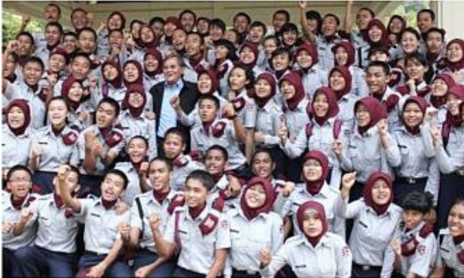
Sampoerna Sponsored Students - "The Brightest of the Poorest"

Education provides opportunity for children to reach their dreams. Unfortunately every four minutes, one kid has to dropout because of poverty. Putera Sampoerna Foundation's initiatives give students a chance to be Indonesia's future leaders.